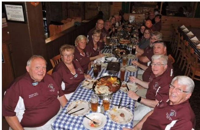
The RI Delegation to the 137 th Supreme Convention

St. Paul Council #95 recently celebrated their 125 th Anniversary. Congratulations Brothers, here's to another 125. (photo below)