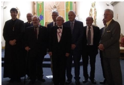
Right: St. Eugene's Council Officers for 2019-2020